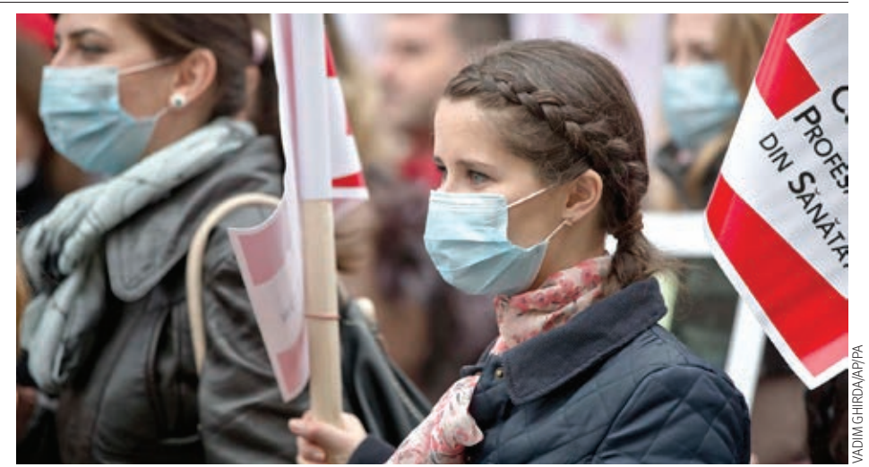
Romanian health staff march in 2013 to demand an increase in the GDP spent on health from 4% to 6%