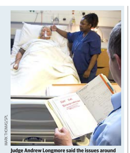
DNACPR notes were "matters of some general importance"