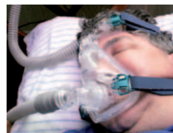
Sleep and obesity, pp 1217, 1247