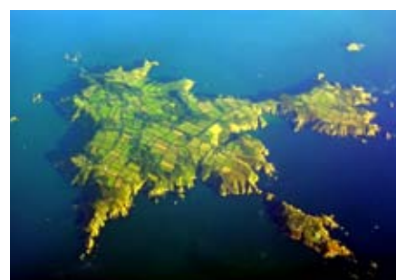
Is Sark the healthiest island? p 1265