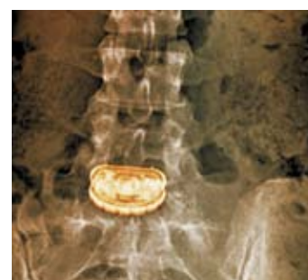
Disc prostheses in back pain, pp 1218, 1249