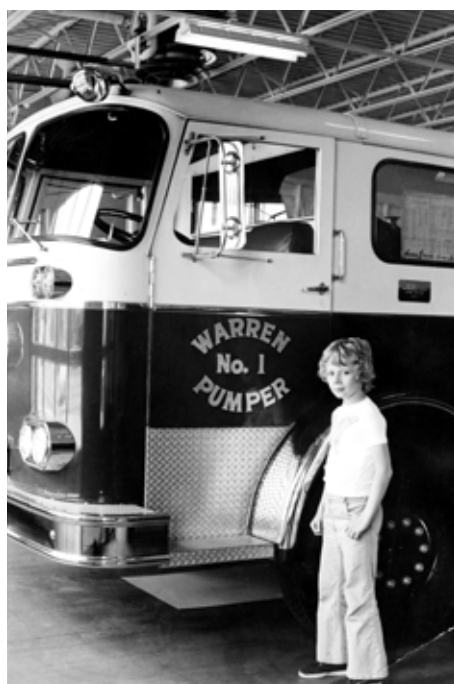
Warren No 1 Pumper, 1971