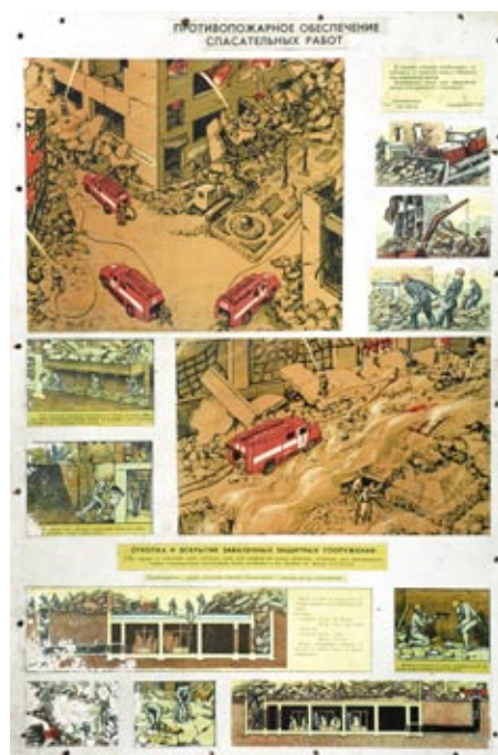
Training board from the Sillamäe bunker