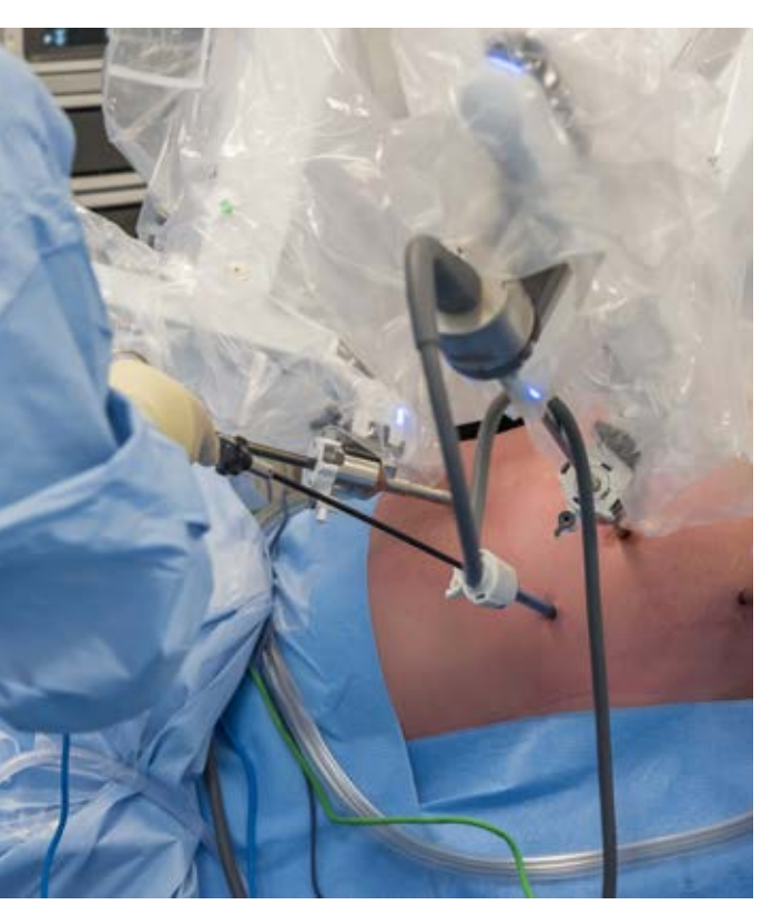
It is absolutely vital that all innovation puts patients' safety centre stage Peter Lamont, RCS